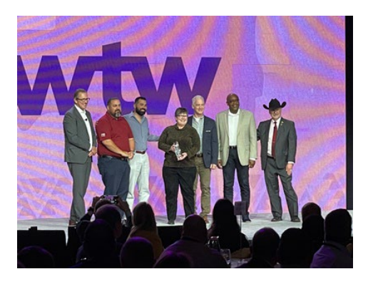
BNBuilders - 1st Place