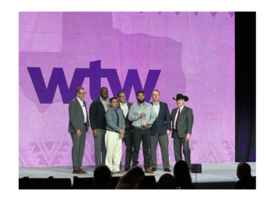
Flatiron - 1st Place