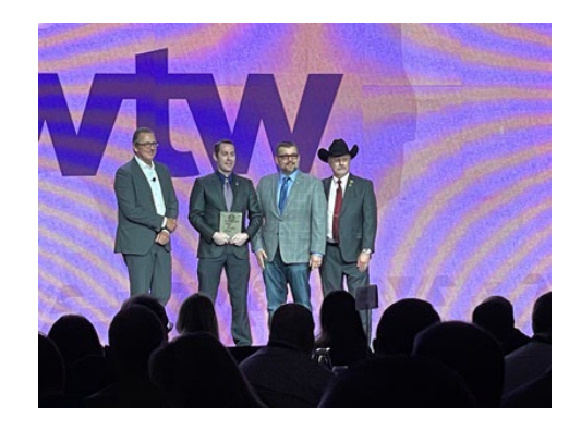
Helix Electric - 3rd Place