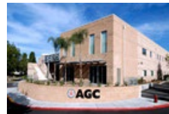
AGC Government Affairs Office & Fall Protection Training Campus