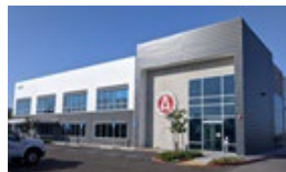
AGC East County Facility & Apprenticeship Training Center 10140 Riverford Road