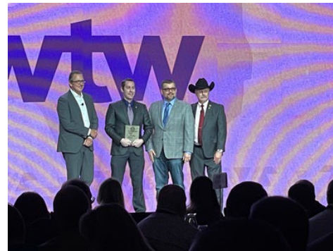
Helix Electric - 3rd Place