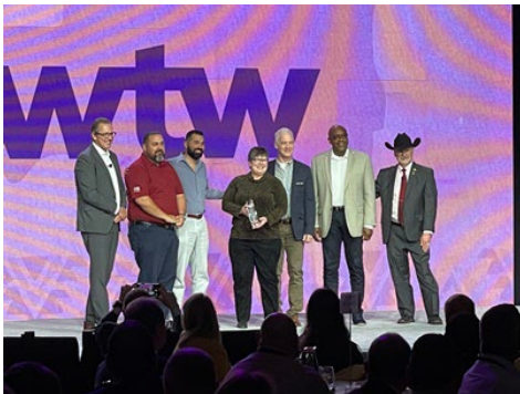
BNBuilders - 1st Place