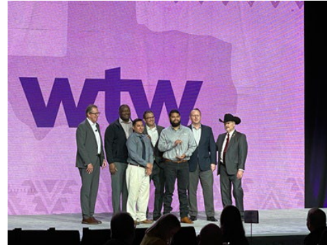
Flatiron - 1st Place